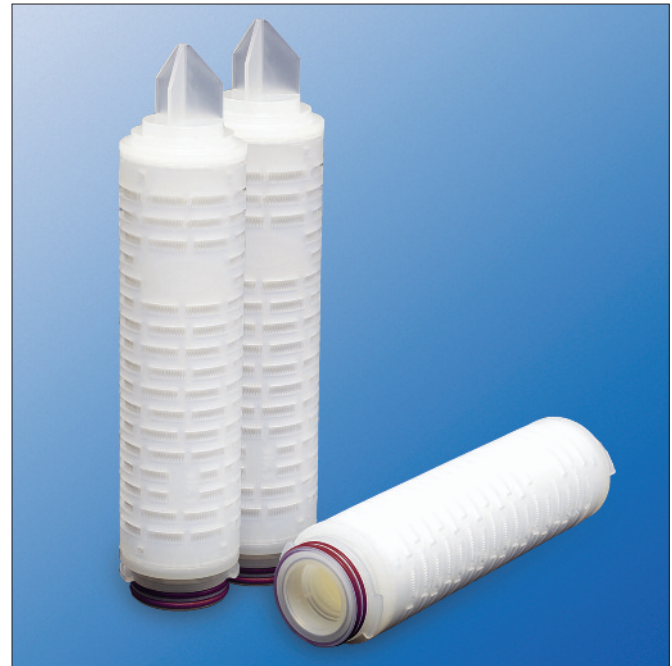
MEMBRACart XL II filter element

In order to ensure traceability each filter element is marked on the cage with ordering code and batch number. In addition, every filter cartridge bears an individual number. Product name, removal rating, ordering code and batch number are indicated on the packing label.