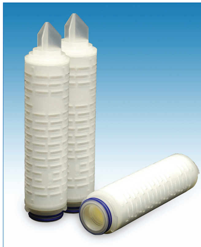
PREcart PP II Filter Cartridges

Please refer to the Pall website http://www.pall.com/foodandbev for a Declaration of Compliance to specific National Legislation and/or Regional Regulatory requirements for food contact use.