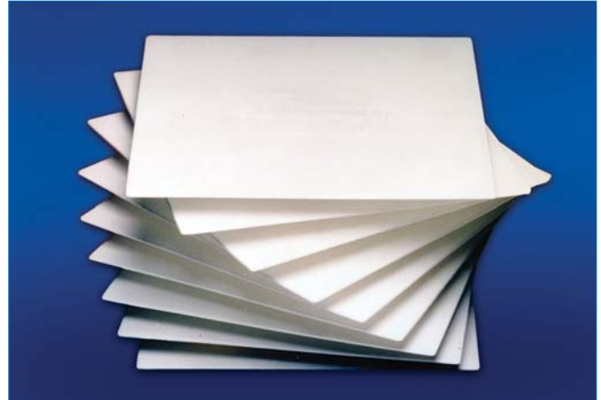
Seitz T Series Filter Sheets